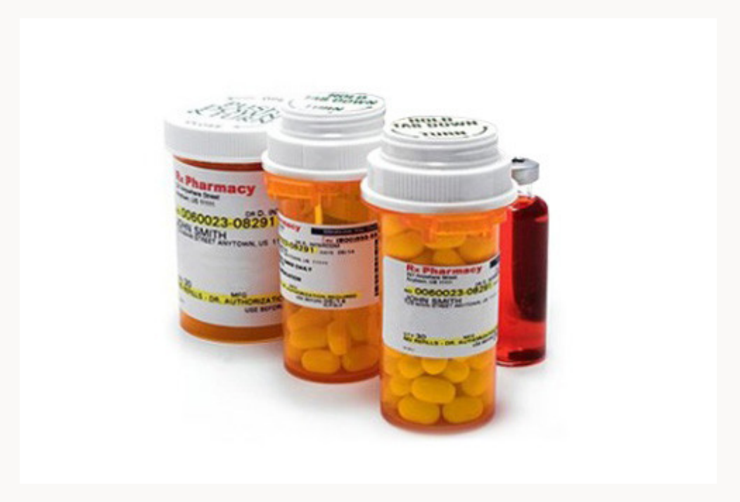
A Prospective Investigation of the Risks of Opioid Misuse Learn More >