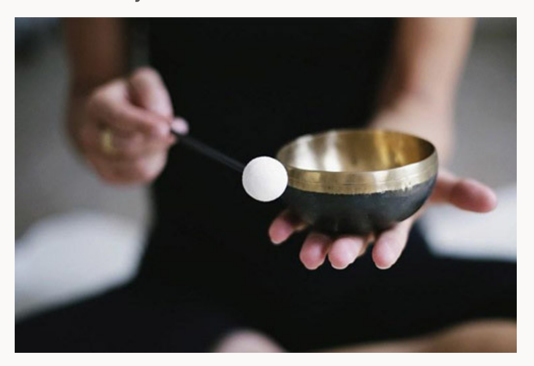
Innovative Telehealth Solutions for Veterans with Chronic Pain <u>Learn More ></u>