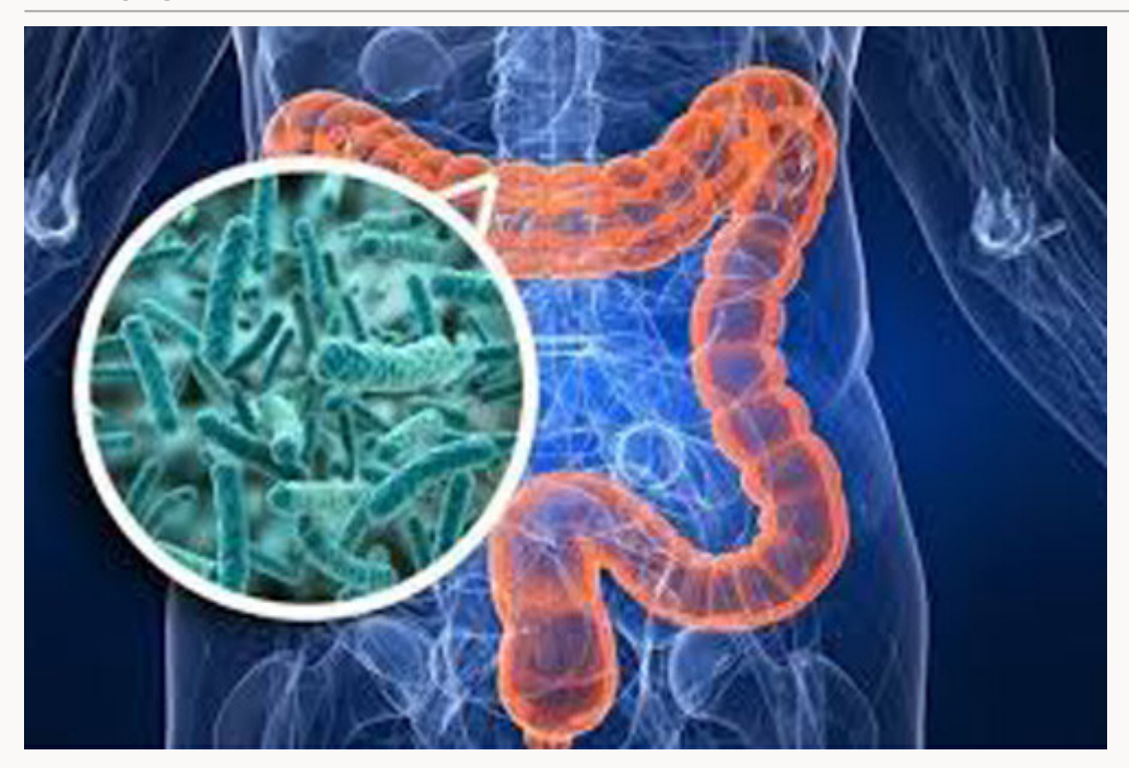
Predicting Resilience in the Human Microbiome <u>Learn More ></u>